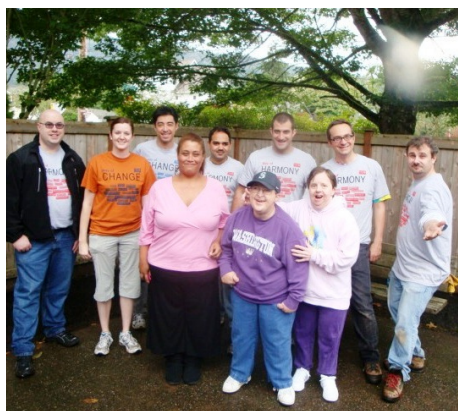
Mountain House Remembrance Garden work party, a hard-working coalition made up of the Microsoft Windows Server volunteer brigade, Mountain House staff and Mountain House clients

Phase II will include; planting various flowers and shrubs such as Camellias, Hydrangeas, Irises, Sweet Olives, Hostas, Wild Ginger, and Rosemary, which signifies remembrance. Once the planting is completed, a boulder, which will have a plaque