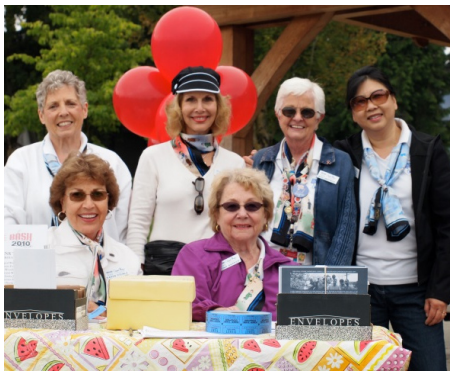
Members of the Clipped Wings bring helping hands and great enthusiasm to the 2010 Bike Bash and Barbecue.